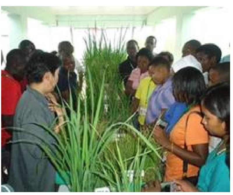
One of the modules in the training course was rice disease identification and management.