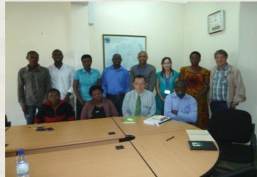
JICA Consultation Rwanda