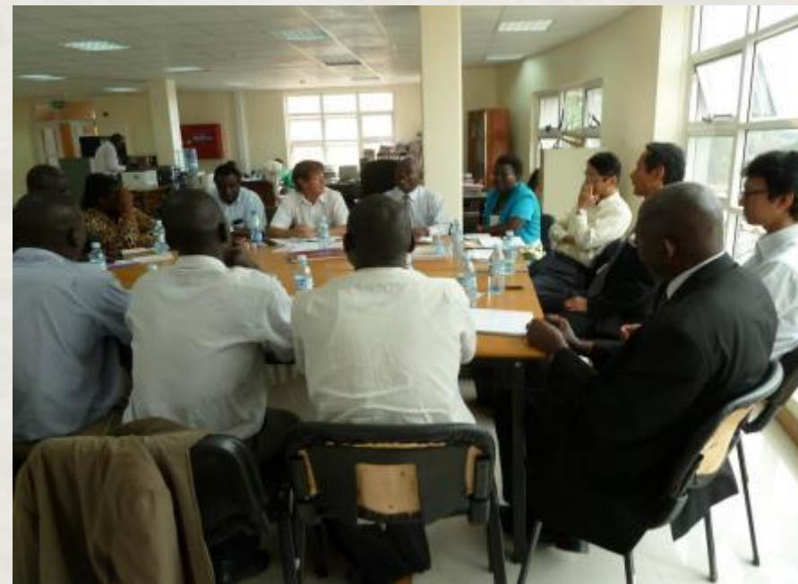
Uganda Directorate and JICA