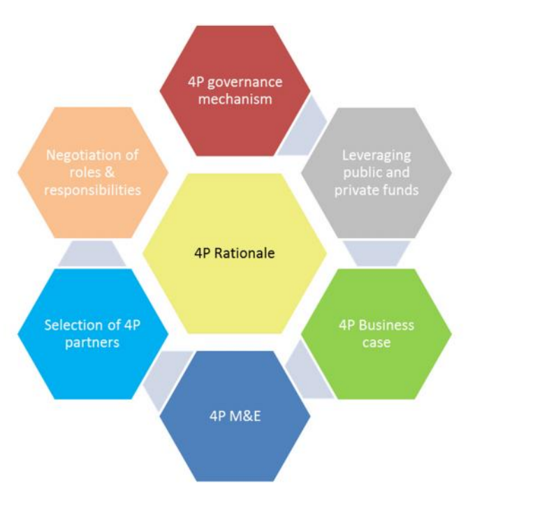
Figure 2: Building blocks of a successful 4P