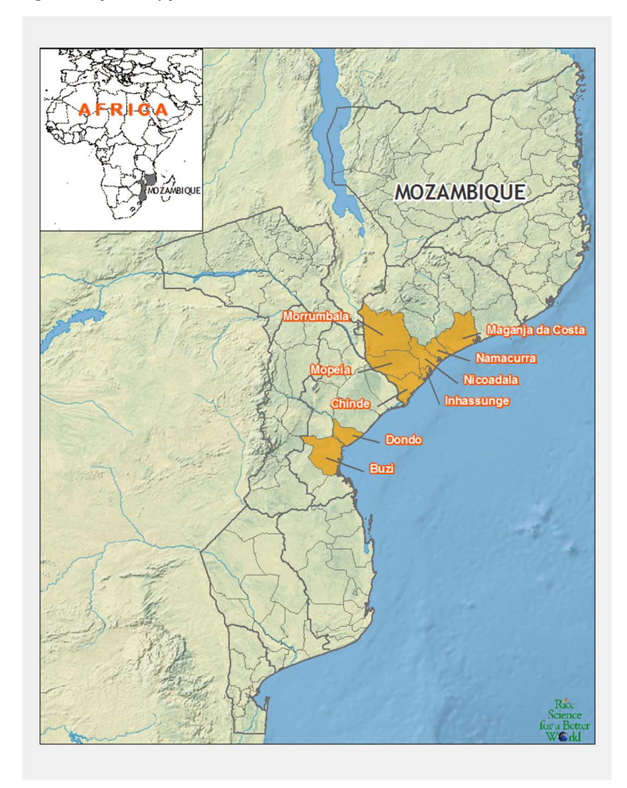
Figure 3: Map of survey province and districts