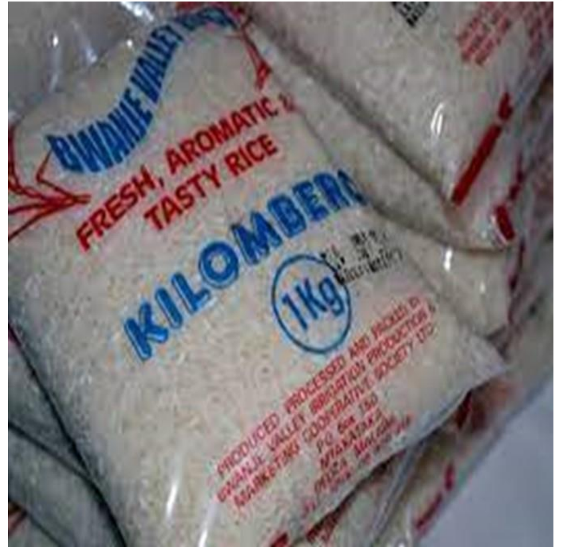
Bwanje Valley Rice Cooperative stride product