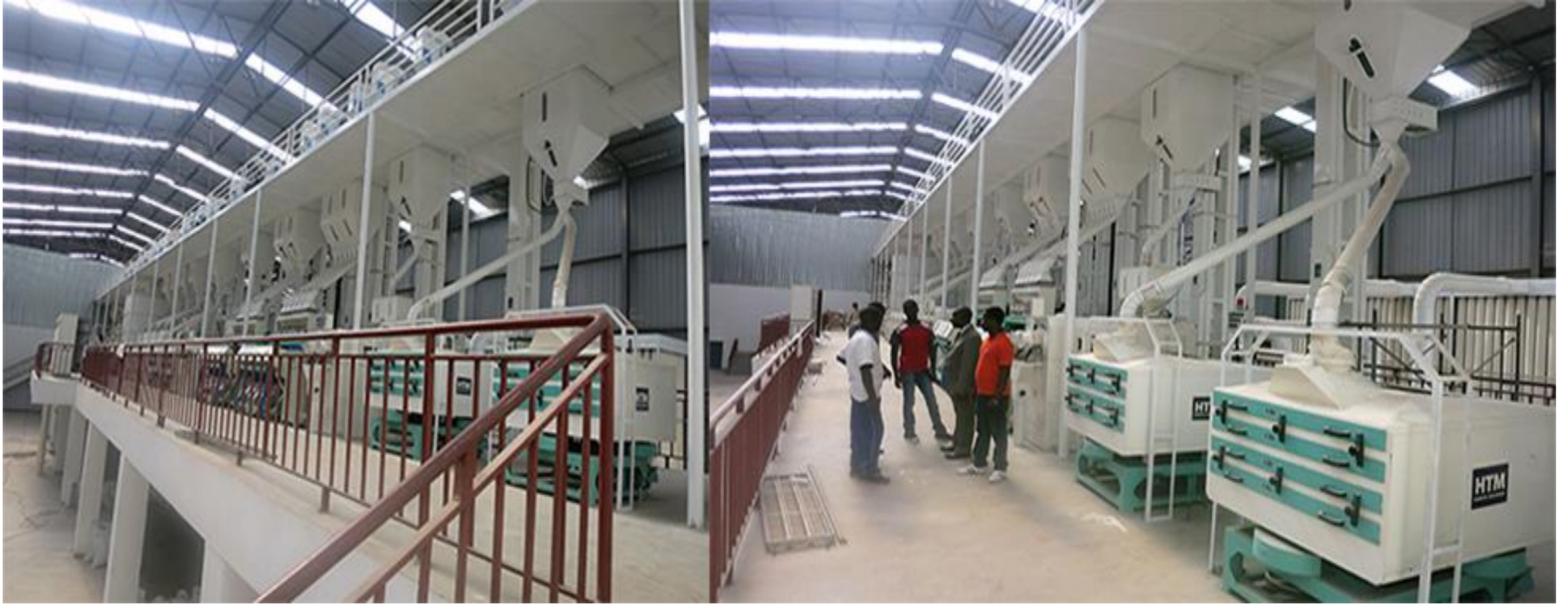
Mtalimanja Holdings Limited (MHL) rice plant in Nkhotakota-200 MT of paddy rice per day