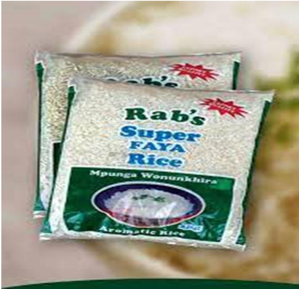
Rab Processors Limited stride product