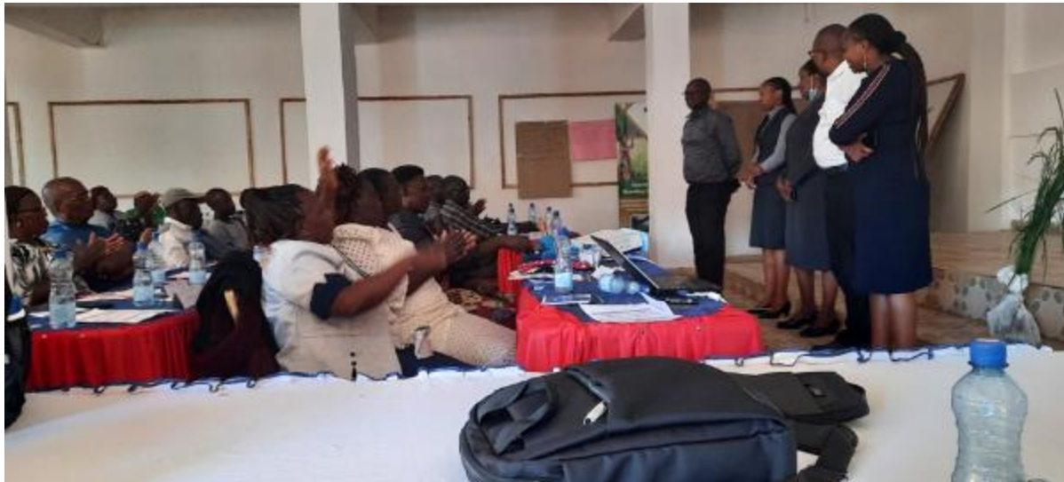
Equity bank team addressing the farmers in Central Kenya on access to finance