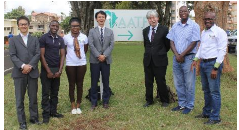
Visit of CARD secretariat team to AATF on 24 March 2023