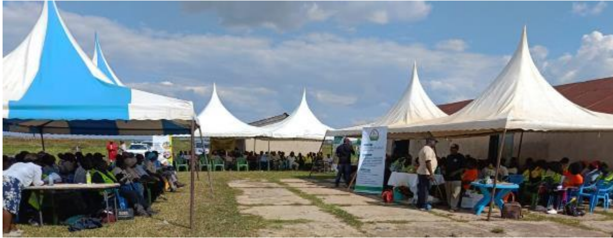
Field day in Western Kenya with input companies exhibition to create linkage with farmers