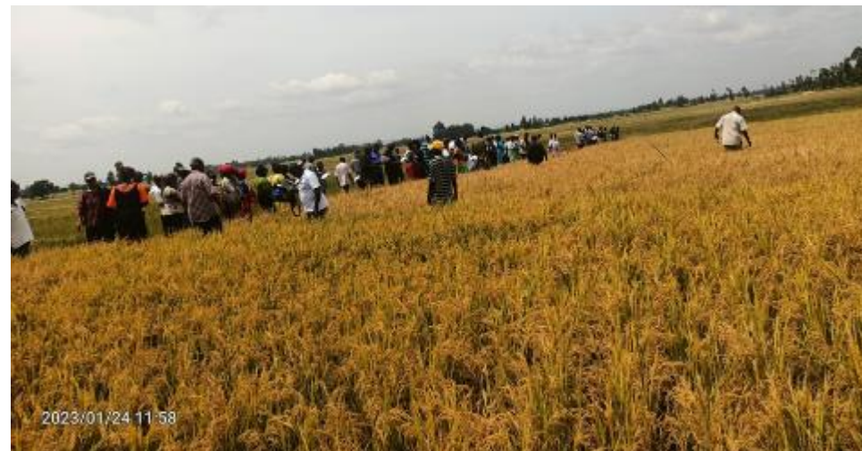
Farmers scoring hybrid rice performance in the field in Nderwa Kirinyaga County on 24th Jan 2023