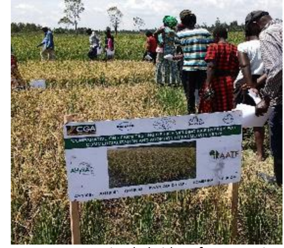
Farmers scoring hybrid performance in Ujwang'a Siaya county in Dec. 2022