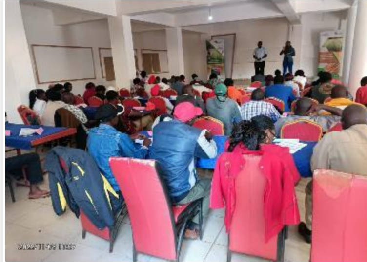
Training farmers on hybrid rice economics in Central Kenya – Nov. 2022