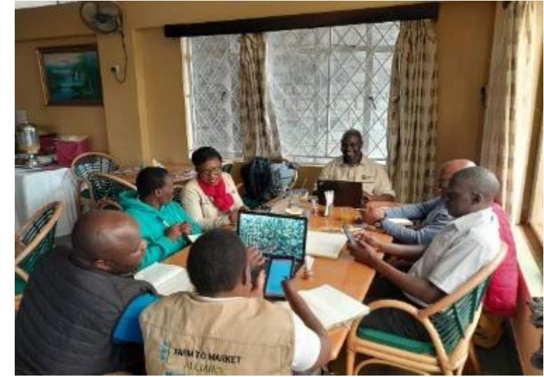
Hybrid rice production training of trainers in Kenya