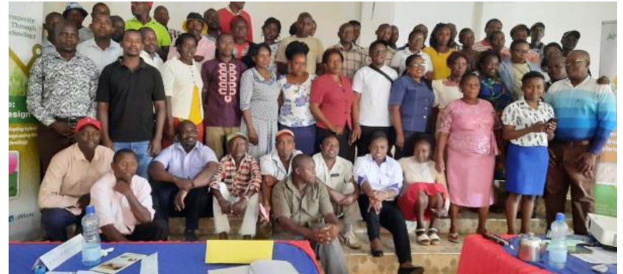
Farmers initiated cooperative for ease access to credit in Central Kenya