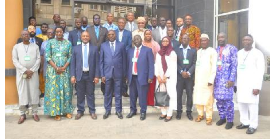
Participated in the Mid-Term Review Workshop RRVCP Phase-I of IsDB in Dakar on 16 March 2023