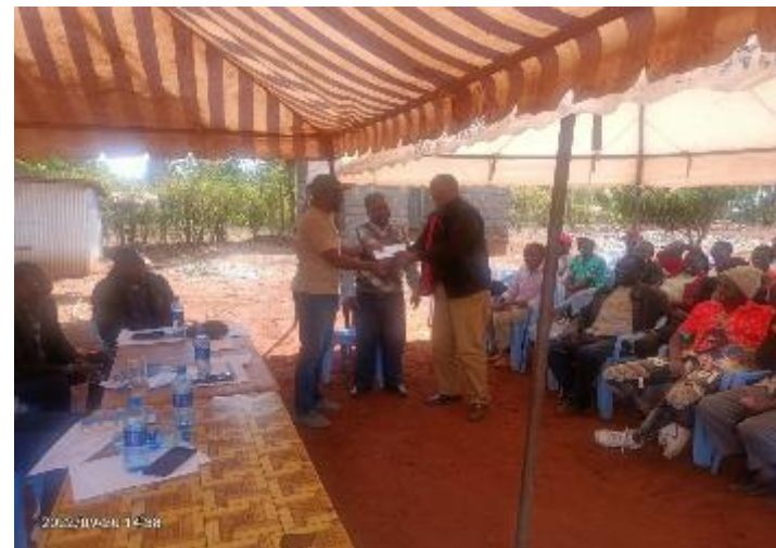
Training farmers in Mwea on biotic and abiotic stress management and awarding farmers from season 1