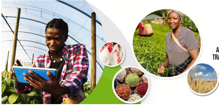
TECHNOLOGIES FOR AFRICAN AGRICULTURAL TRANSFORMATION (TAAT)